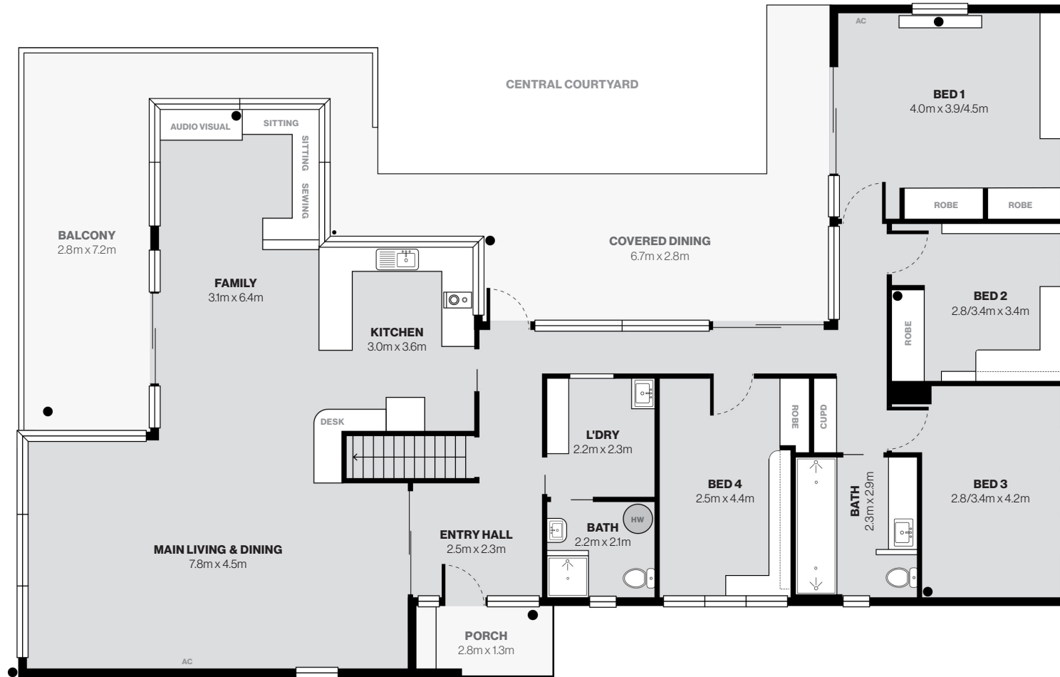
UPPER / MAIN ENTRY LEVEL